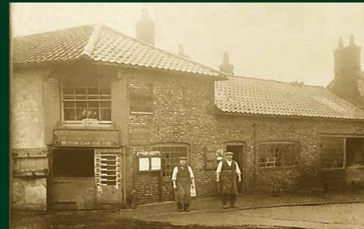
The Old Forge